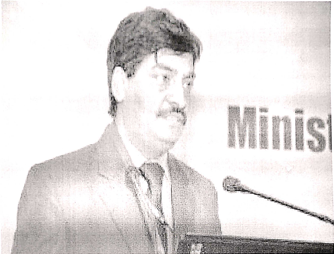
Three-member World Bank team calls on J&K Chief Secretary